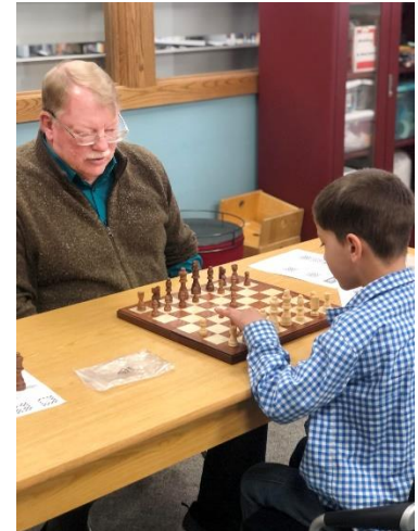
Students of all ages participate in the intergenerational chess club at the Ruby Sisson Library.

In addition to books and computers, your Ruby M. Sisson Memorial Library is a place where people of all ages gather to explore, share, discover, and dream. We are a warm sanctuary for some and a refuge from loneliness for others. We provide online access to education and employment opportunities, literacy support for children and adults, access to information and life-long learning opportunities that are free of charge for everyone in the community.