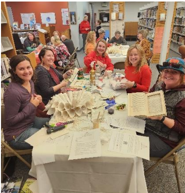
Participants enjoy making a variety of crafts at our first Late Night at the Library craft night.

Approximately 85% of the work completed by the staff and volunteers of the Ruby Sisson Library Foundation & Friends was directed towards the Mountains of Opportunity capital campaign to expand and renovate the Ruby Sisson Library.